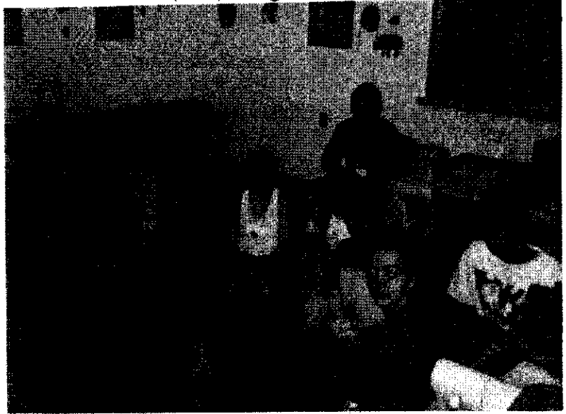
Annette Leiby (St.P) determined to teach as she battles the annoying symptoms of chemotherapy.